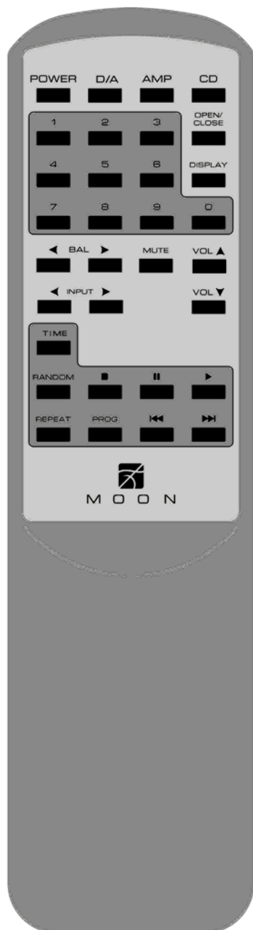
Figure 3: CRM-2 Remote Control

The MOON 360D CD Player uses the ' CRM-2 ' full-function remote control (figure 3). It operates on the Philips RC-5 communication protocol and is can be used with other Simaudio MOON components.