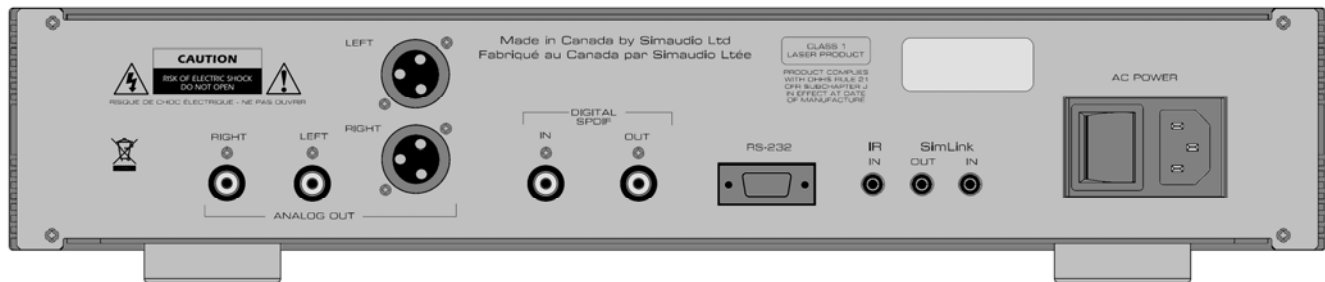
Figure 2: MOON 360D Rear panel with optional balanced analog outputs

The rear panel will look similar to Figure 2 (above). On the left side is the analog audio output. There is one pair of RCA analog audio output connectors labeled “ANALOG OUT” that you should connect to a stereo analog input on your preamplifier or integrated amplifier.