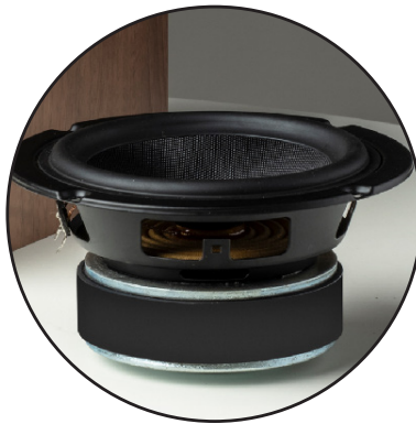
5" fiber glass bass/mid woofer

Extra dense acoustically optimized MDF. Allen screws fix the chassis mechanically perfect to the cabinet.