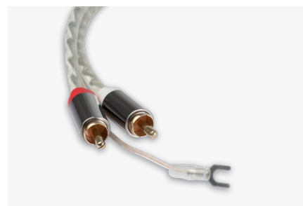
High-quality semi-balanced Connect it E phono interconnect