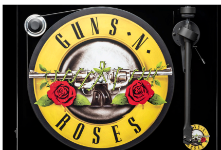
Acryl platter with Guns N' Roses print