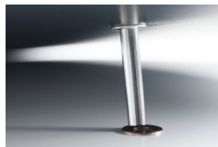
Main platter bearing with low tolerances: reduced rumble, reduced wow & flutter