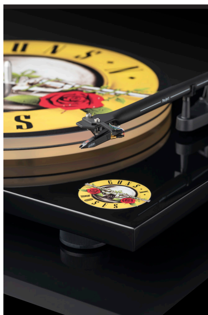
One piece 8.6" aluminum tonearm Cartridge: Ortofon OM10

ly printed onto the platter itself. A first for any Pro-Ject turntable, it makes the entire platter glow in a translucent yellow. A dust cover and our high-quality Connect it E phono RCA cable are included in the packaging.