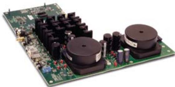
Main PCB, featuring separate analog and digital toroidal power transformers. Oversized, extruded heatsinks for each individual voltage allow the system to run cool.