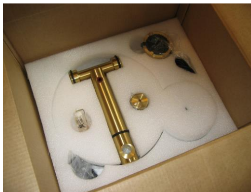
Fig. 3 Unpacking: T base and parts .