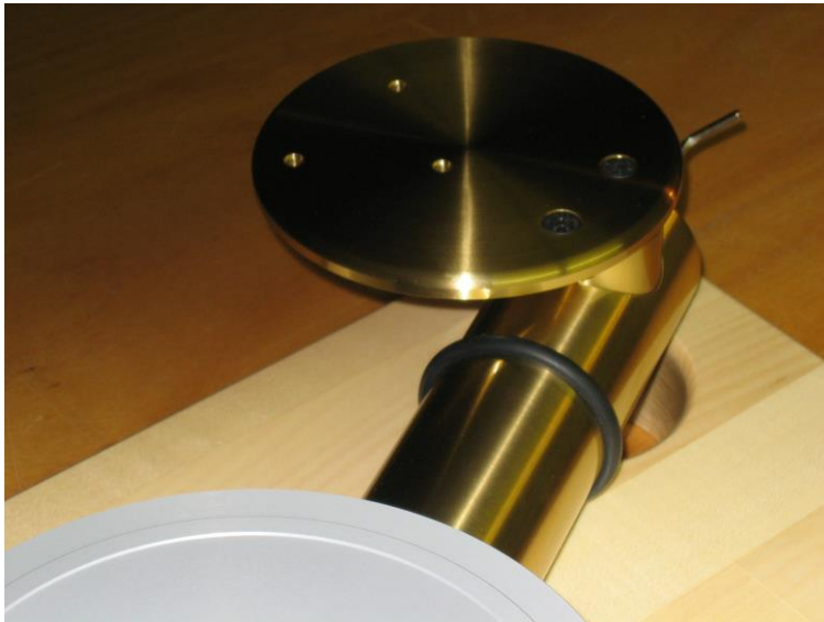
Fig. 7 Circular brass armbase