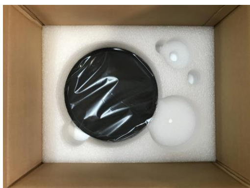
Fig. 5 Unpacking: platter