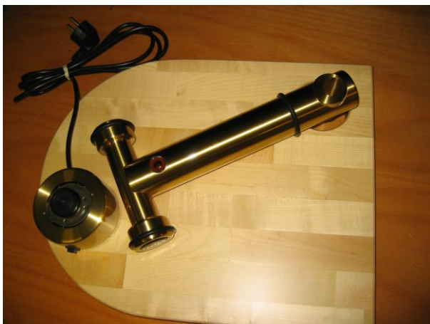
Fig. 6 Position T base + motor tower

Remove the foam and lift the main T base ( Fig. 3) of turntable carefully as it is heavy and put it on a shelf so that the side with the bearing is situated at 8 o' clock and the side with the tonearm mount at 2' o clock. See Fig 6.