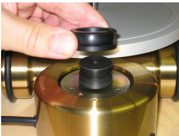
Fig. 8 45 rpm crown ring adaptor ( no PS)

The pulley fitted is for 33 rpm. Find the black plastic crown pulley ring which fits over the existing motor pulley increasing the diameter of the motor pulley and bringing the speed up to 45 rpm. To do this the platter must first be removed and, with clean fingers, stretch the belt away from the motor pulley while, with the other hand, pushing down crown pulley ring. Make sure the thicker ridge goes down. See Fig. 8. Return platter. To remove the crown pulley reverse the procedure.