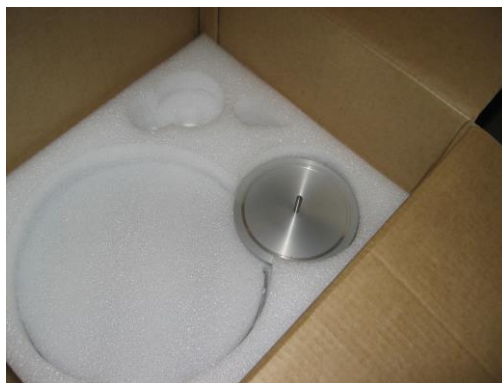
Fig. 4 Unpacking: subplatter