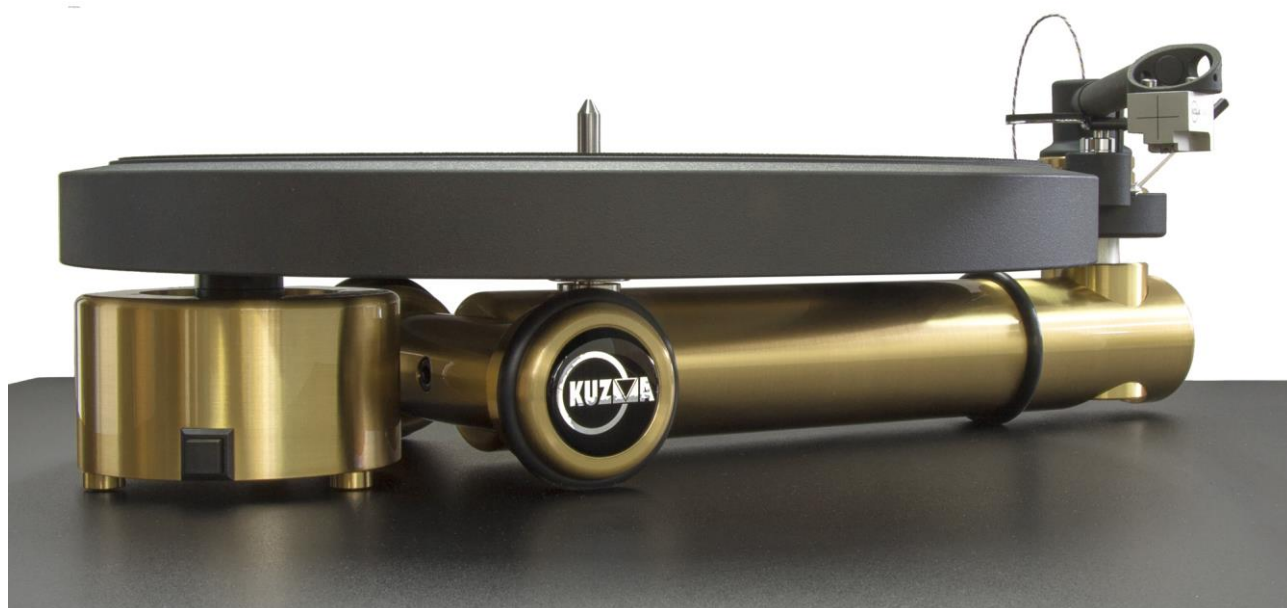
Fig. 2. Stabi S turntable with optional Stogi S tonearm and CAR cartridge