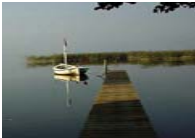
Gryphon is located in beautiful tranquil surroundings.

While scientific method and sophisticated technology play an important role in our electronics design work, at Gryphon we never lose sight of the fact that the keen ears of an experienced listener are the most crucial "calibration tools." Therefore, every Gryphon product exists for one simple purpose: to bring the user closer in the never-ending quest for a more natural and convincing musical illusion.