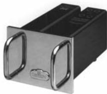
The Gryphon Head Amp 1985

of creating fine home audio components. We know that you will appreciate and enjoy the benefits of our accumulated experience and share our abiding passion for music.