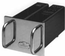
The Gryphon Head Amp 1985