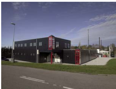
The house of Gryphon, this is where all Gryphon products are developed. Manufacturing is in the hands of a select number of highly specialized danish companies. We take the "Made in Denmark" very seriously.