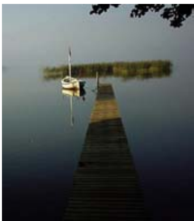
Gryphon is located in beautiful tranquil surroundings.

region with no natural resources (no oil, coal, precious metals, etc.), the Danes have learned to rely on their quick wits and skilled hands. Innovative technology, beautiful craftsmanship, pride in one's craft and a keen eye for attractive design are some of the long-standing Danish traditions which are distilled to their finest essence in every unit that bears the Gryphon name.