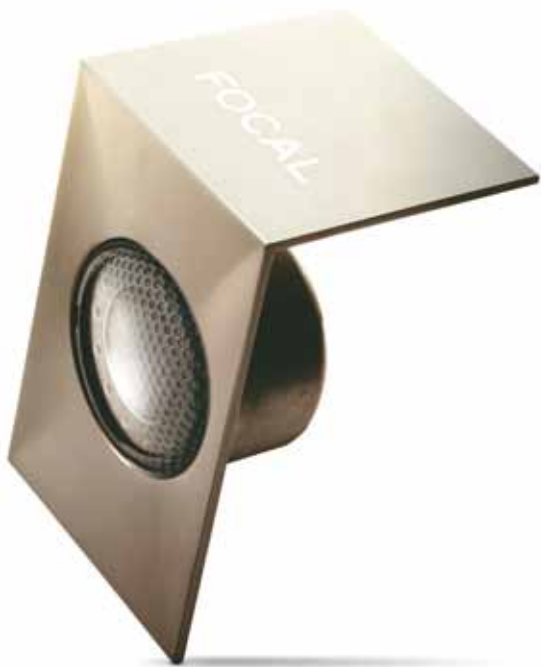
> TNV2 tweeter.

new generation of Chorus 700 loudspeakers offers a design and quality which stands up to the expectations of today's music lovers: remarkable audio performance combined with increased perceived value and elegance.