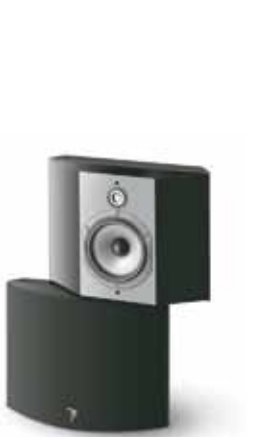
The SR 700 is a compact and discreet loudspeaker which can be easily integrated into your interior thanks to the built-in Polyfix wall mount. Featuring an optimized phase and the same speaker drivers as the Chorus line, the SR 700 is ideal for surround sound in large rooms and for accompanying various Chorus multi-channel installations.