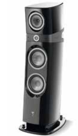
The eldest of the line, the Sopra N°3 loudspeaker perfectly combines dynamics, spatialisation and harmonic richness. With its two 8" (21cm) woofers, it delivers solid and rich bass with perfect definition, satisfying the high demands of audio enthusiasts looking for ultimate performance. Despite its reasonable size, its full potential can be heard in rooms measuring up to 850 ft² (80m²).