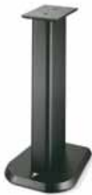
> 24" (60cm) Chorus S700 stand, Black Satin finish.