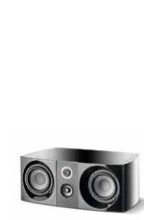
Sopra Center allows you to extend the Sopra experience to your Home Cinema. Sopra Center uses all the design aspects of Sopra loudspeakers to their full potential in order to optimise integration into your interior.