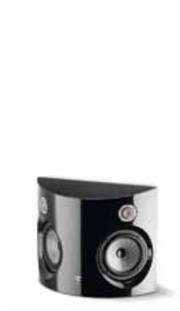
Surround Be benefits from the exclusive "BiTwin" structure with dual input permits to use it as well as in a 5.1 system (in bipolar mode) as in a 7.1 system (in dual mono mode). The result? Not multiplying the number of surround loudspeakers in your Home Cinema room.