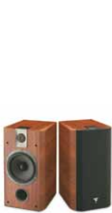
The Chorus 706 is the archetypical benchmark bookshelf loudspeaker: true to Focal tradition. Compact and very well proportioned, it blends in perfectly with its surroundings. The outstanding balance, precision and definition provide you with the perfect loudspeaker for rooms of approximately 215ft2 (20m²) without any sound limits.