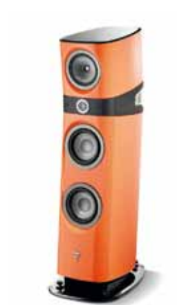
Sopra N°2 clearly inaugurates a new era for the "Premium High End" bringing new performance criteria. Equipped with best midrange drivers ever developed by Focal, with the "NIC" and "TMD" technologies, Sopra N°2 pushes back the limits of sound reproduction in terms of transparency in a very compact enclosure. It is perfectly at ease in rooms measuring up to 320ft2 (30m²), and is even ideal for larger rooms measuring up to 750ft2 (70m²).