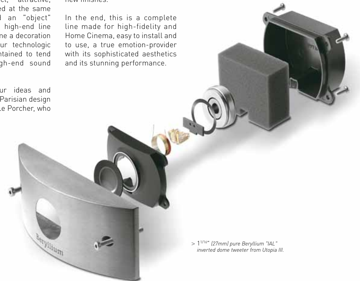
> 1 1/16" (27mm) pure Beryllium "IAL" inverted dome tweeter from Utopia III.

In the end, this is a complete line made for high-fidelity and Home Cinema, easy to install and to use, a true emotion-provider with its sophisticated aesthetics and its stunning performance.