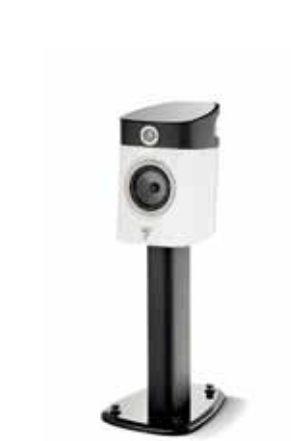
Compact and powerful, Sopra N°1 is a concentration of technological innovation. It features Neutral Inductance Circuits "NIC", Tuned Mass Damping surrounds "TMD" for the midrange woofer, and Infinite Horn Loading "IHL" of the tweeter. It is a true demonstration of the contribution of the new technologies implemented on Sopra. Its special stand has been designed to ground interfering vibrations from the enclosure to the floor to avoid any colouration. Ideal for small rooms up to 270ft2 (25m²) and medium sized spaces up to 550ft2 (50m²).