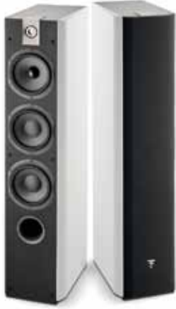
The Chorus 726 embodies the affordable traditional high-end loudspeaker: the restyled cabinet, combined with the new design of the cloth frames give these speakers a modern and slender look. Very technologically advanced, the 3-way design combines the exceptional definition of the midrange and the power of the two 6.5" (16.5cm) woofers, providing a great, ample and generous sound for spaces up to 430ft² (40m²).