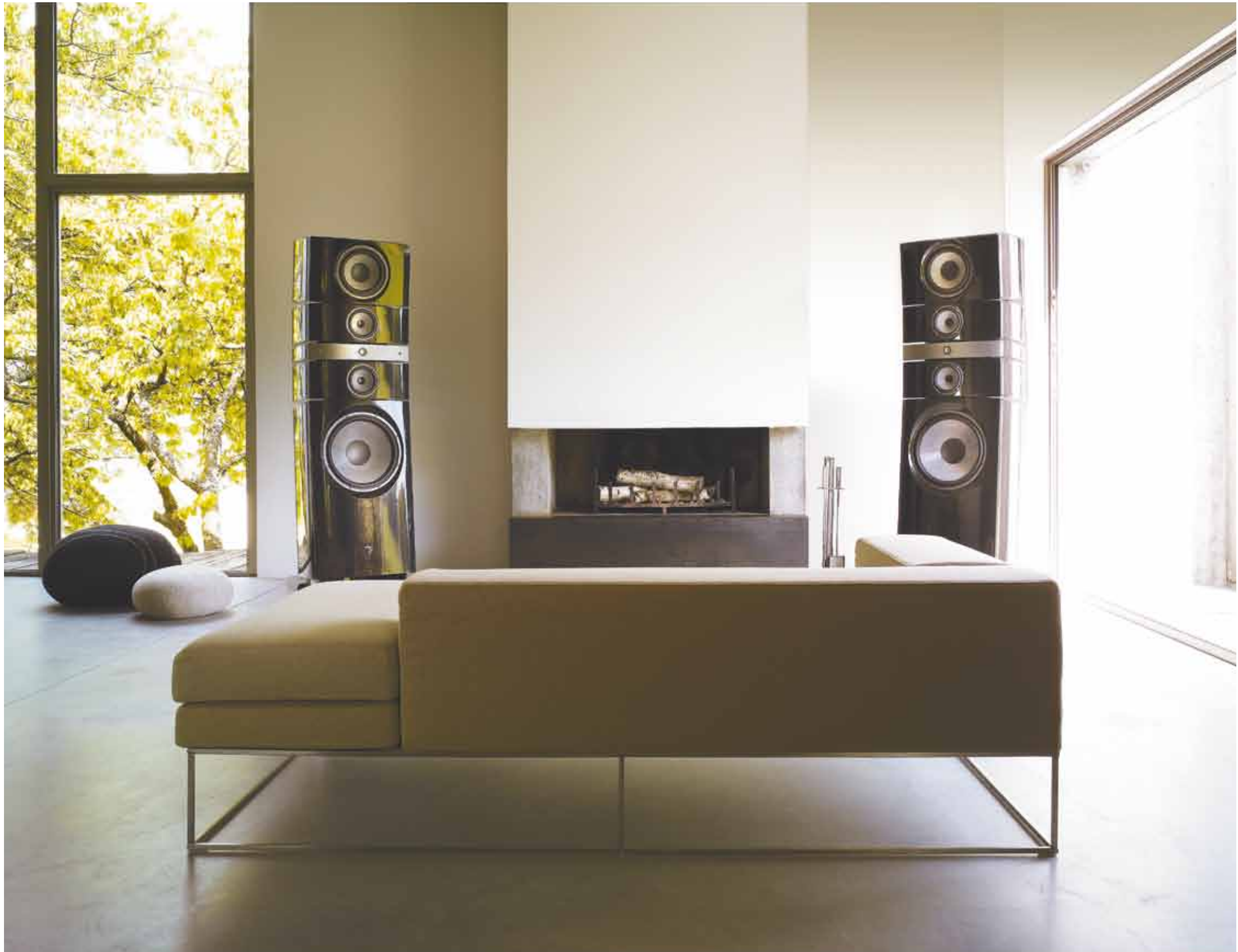
> Grande Utopia EM Black Lacquer finish.