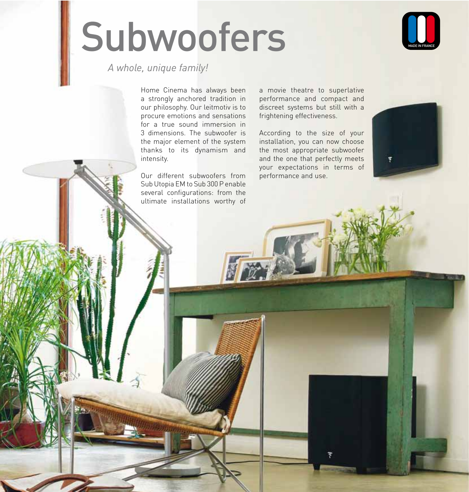
> Subwoofer Sub 300 P.