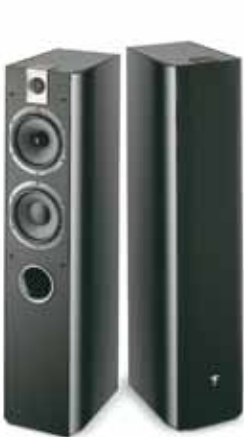
Chorus 716 is a 2.5-way loudspeaker with a high-end configuration thanks to its two 6.5" (16.5cm) speaker drivers working in tandem (only the top driver transmits the midrange). This configuration doubles the effect of the bass, perfect for rooms measuring up to 320ft² (30m²).