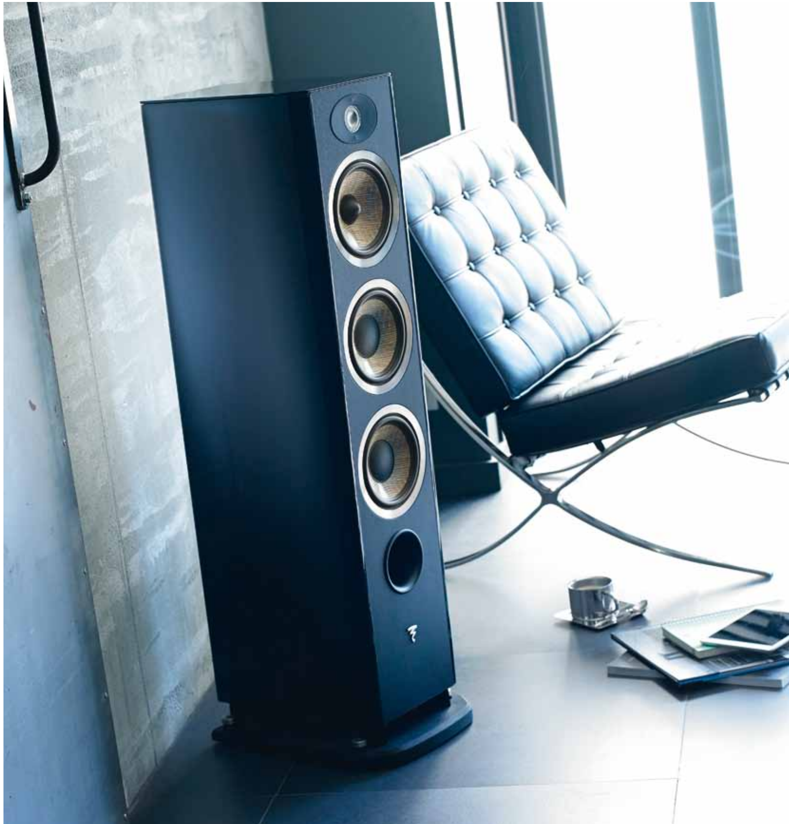
> Aria 926, Black High Gloss finish.