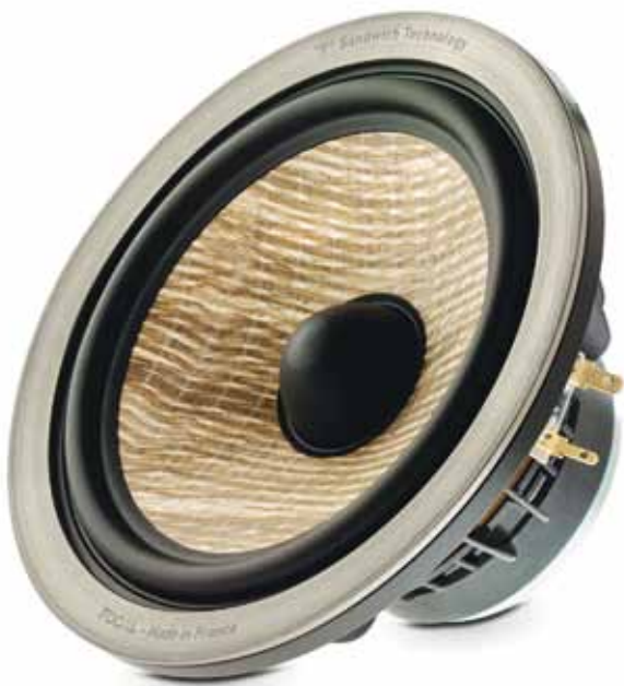
> Flax sandwich driver.

The vast range of Aria 900 products is ideal for stereo and Home Cinema audio systems. The two 8" (21cm) woofers of the 948 model mark a return to true expressive and dynamic high-fidelity loudspeakers.