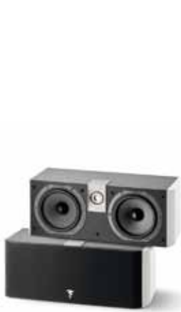
The Chorus CC 700 is a center speaker which blends in perfectly with the entire Chorus line thanks to the optimization of the phase, resulting in optimal directivity and excellent acoustic coherence which is reinforced thanks to the high quality of its dynamics, linearity and timbre.