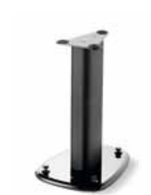
> 24" (60cm) Sopra Stand, Graphite Black finish.