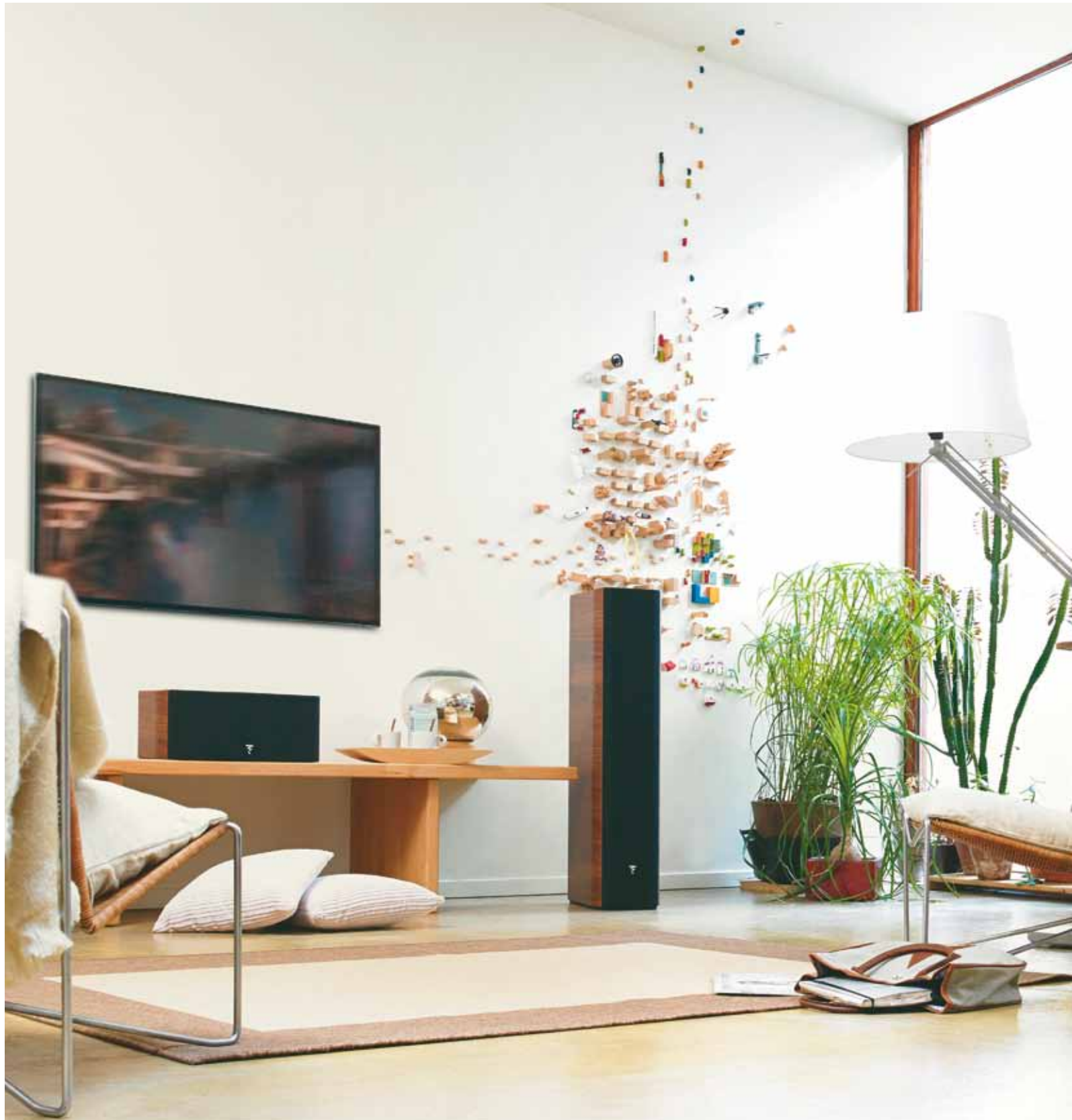
> Chorus 726 Walnut finish.