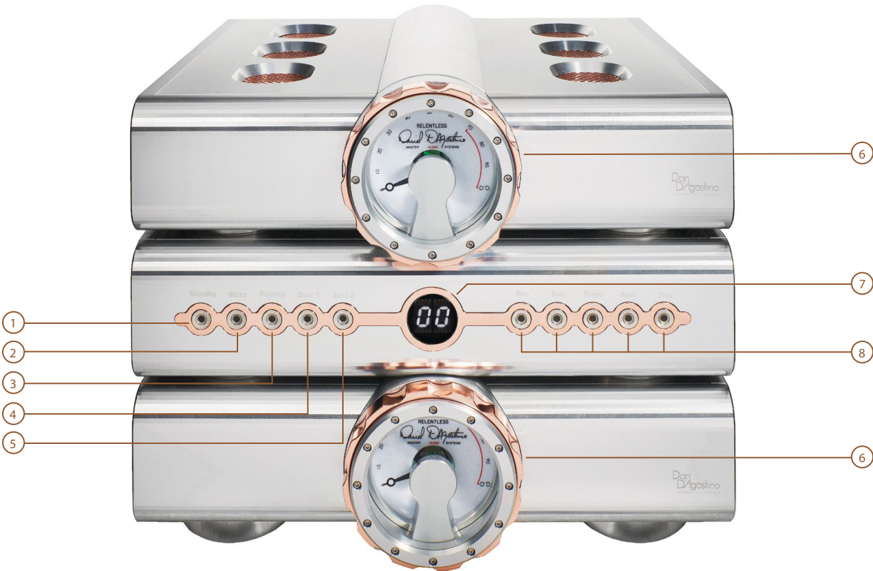
Audio Chassis and Power Supply (front)