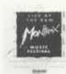
BW004 Live at the B&W Montreux Music Festival 1989 Vol 1