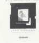
BW008 Live at the B&W Montreux Music Festival 1990 Vol 1