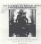
BW001 The Academy of Ancient Music: Christopher Hogwood