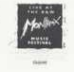
BW007 Live at the B&W Montreux Music Festival 1989 Vol 4