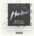
BW005 Live at the B&W Montreux Music Festival 1989 Vol 2