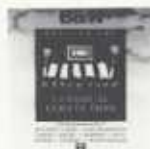
BW003 The EMI Abbey Road Classical Collection